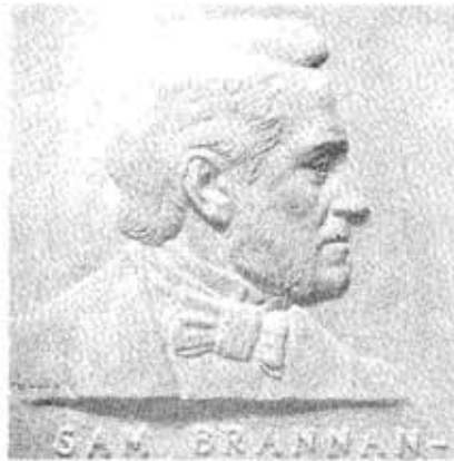
14. SAM BRANNAN Arrived in California, 1846. Was successful in finding gold on the American River, 1848. Became builder and civic leader of early San Francisco.