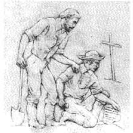
18. CHILI BAR MINERS While working the rich sand of the bar (1860) several skeletons of argonauts from Chile, who died of smallpox in 1852, were unwittingly uncovered. With reverent care the remains were moved to a new grave site on higher ground. A cross was erected and a simple stone tablet was carved to mark the plot.