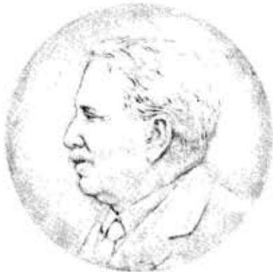
9. HENRY R WAGNER A Clamper who, in middle life, turned his back on monetary wealth to devote full time to history. Result: he became an outstanding historian of "The West."